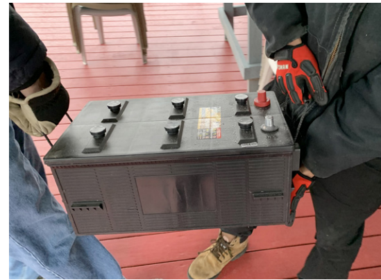
With the old batteries removed, Pete Pappas and Tony's son Nico carry the new ones into the clubhouse. These units are HEAVY!