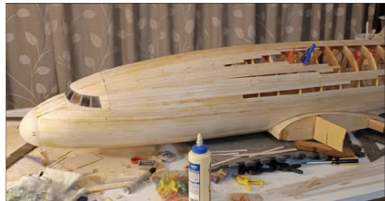
Traditional model aircraft building

A quick search on Facebook is all it takes to get engaged...check it out!